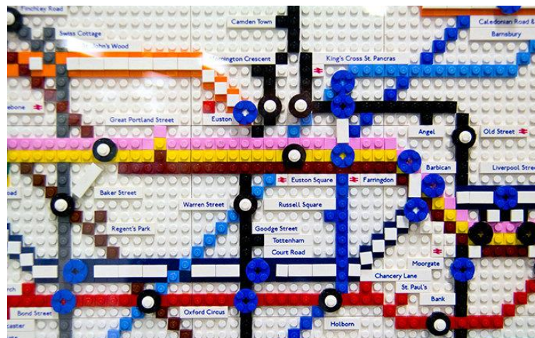
Lego map of the London Underground