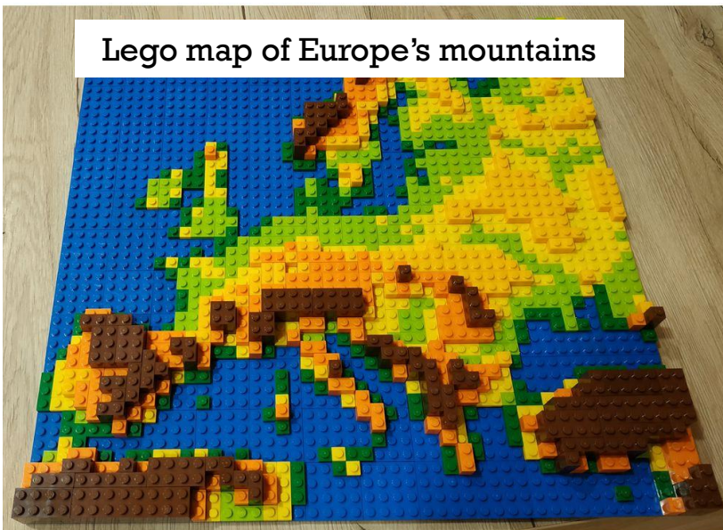
Lego map of Europe's mountains