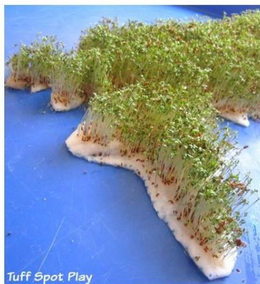
Tuff Spot Play