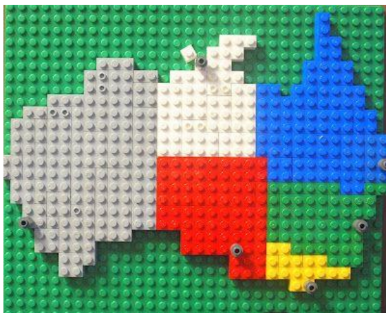
Lego map of the states & regional capital cities of Australia