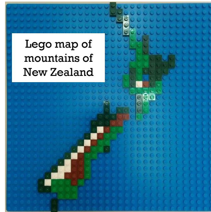
Lego map of mountains of New Zealand